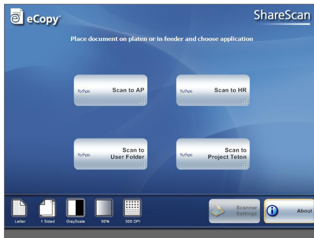
Easy to understand user interface

Bates Numbering. The Bates Number Service is an add-on service that enables users to mark scanned images with sequential page numbers and standard text messages. Add a unique Bates Number to each scanned document for use in document reference and retrieval.